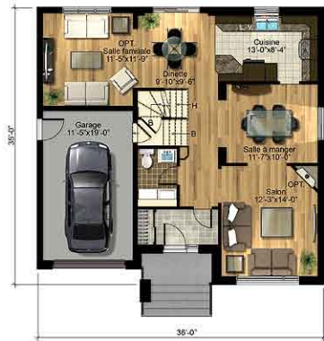
REZ-DE-CHAUSSÉE 952 pi 2