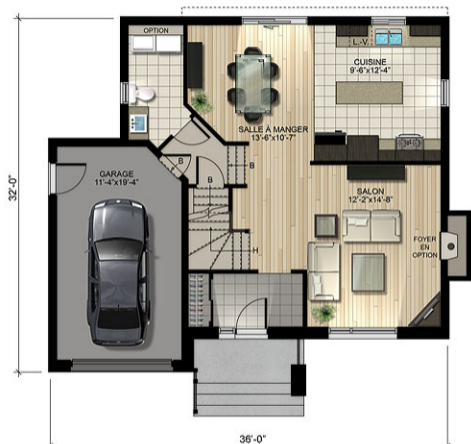
REZ-DE-CHAUSSÉE 766 pi 2 / GARAGE 245 pi 2